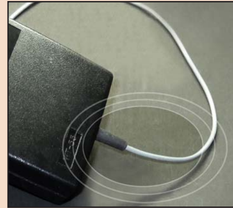
Figure 4 The antenna cable should be straight when it's in use

Each wireless microphone system must be on its own separate channel or frequency. If another system is on the same channel, interference will occur. When you purchase a wireless microphone, try to verify the frequency of other wireless systems in the area such as churches, schools, etc. Then select a channel that won't interfere with those other microphones. If you're using multiple wireless microphones in your church, you must select channels that are compatible with each other. Just