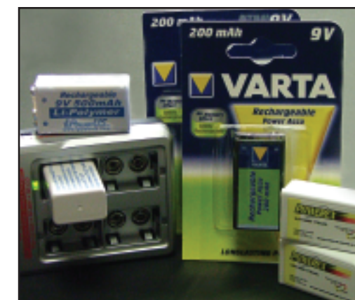
Figure 1 9-volt rechargeable batteries

The key is to have fresh batteries. However, buying a new battery doesn't guarantee it's good. Always check your battery with a battery tester if you want to avoid a nasty surprise. For long battery life, use an alkaline battery. The new lithium types can give an even longer life.